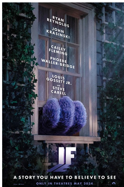
IF May 18, 2024