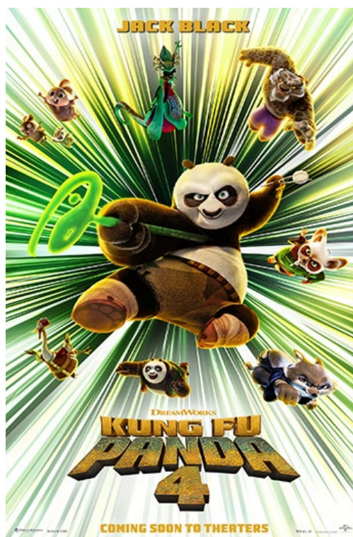
Kung Fu Panda 4 April 6, 2024